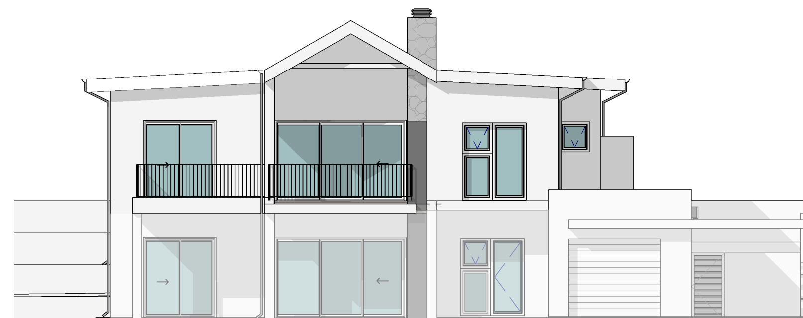
Back Elevation 1 : 100